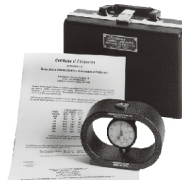
MODEL 7BC Morehouse Low Profile Brinell Calibrator