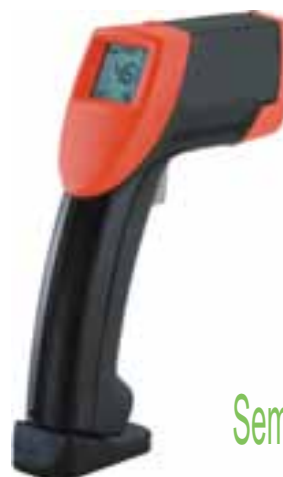
SemiTemp 2030 B2